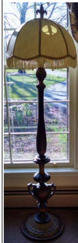
When the sun shines